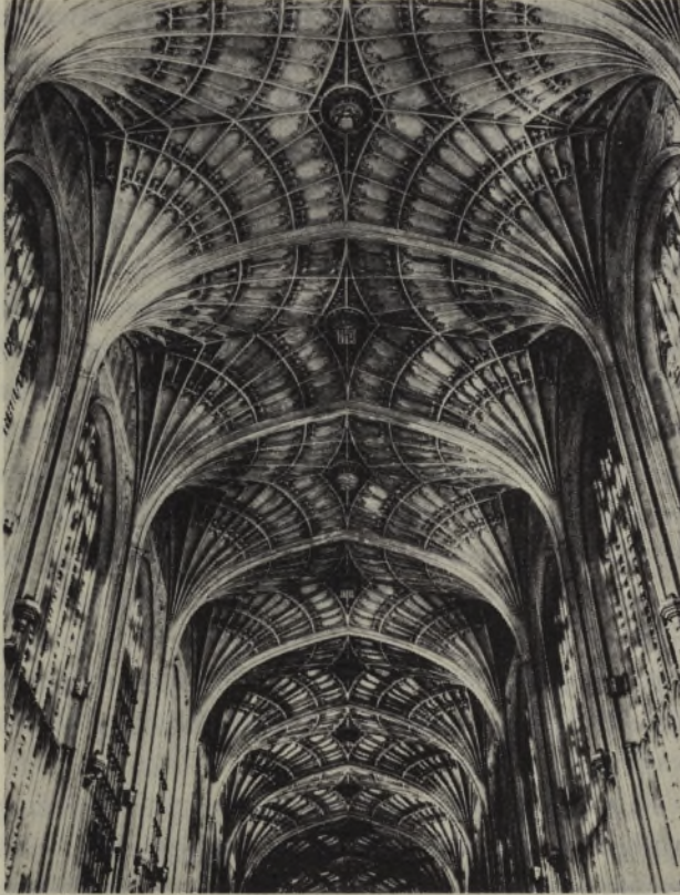
FIGURE 2. The ceiling of King's College Chapel.

the Tudor rose and portcullis. In a sense, this design represents an 'adaptation', but the architectural constraint is clearly primary. The spaces arise as a necessary by-product of fan vaulting; their appropriate use is a secondary effect. Anyone who tried to argue that the structure exists because the alternation of rose and portcullis makes so much sense in a Tudor chapel would be inviting the same ridicule that Voltaire heaped on Dr Pangloss: 'Things cannot be other than they