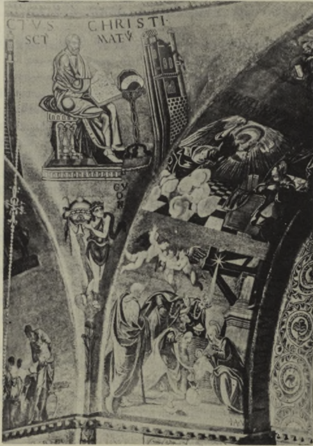
FIGURE 1. One of the four spandrels of St Mark's; seated evangelist above, personification of river below.

The design is so elaborate, harmonious and purposeful that we are tempted to view it as the starting point of any analysis, as the cause in some sense of the surrounding architecture. But this would invert the proper path of analysis. The